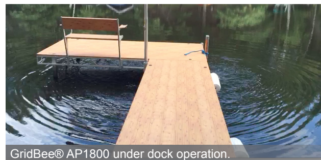
GridBee® AP1800 under dock operation.