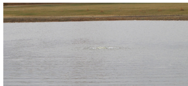
GridBee® AP1800 recreation pond application